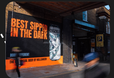
Brick Lane (1001)